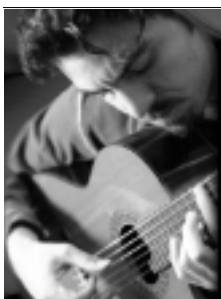
June 6: Eastern Blok