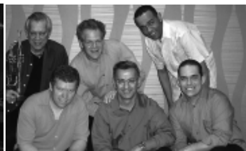
June 20: Tumbao Bravo !